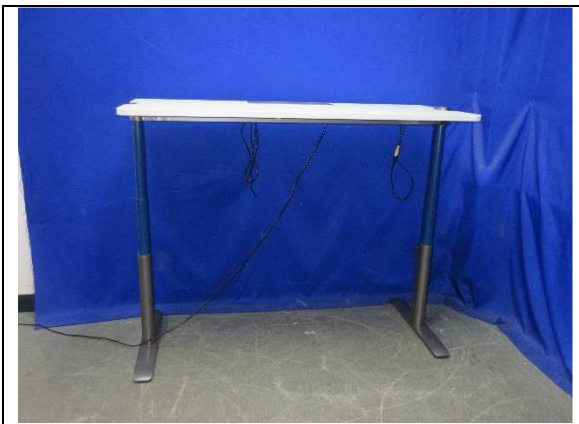
Sample as received - View 3