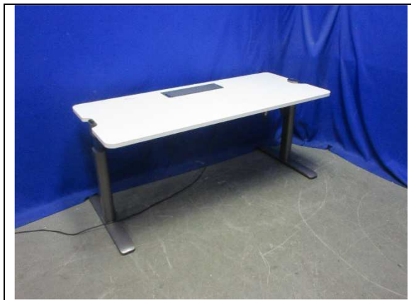
Sample as received - View 2