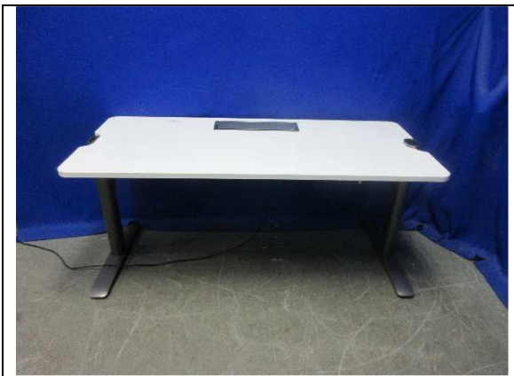
Sample as received - View 1