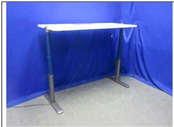
Sample as received - View 4

SGS authenticate the photo on original report only